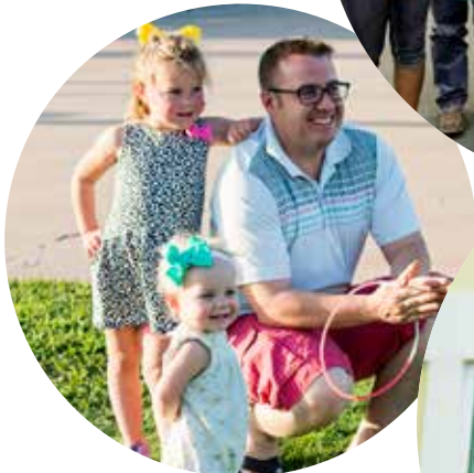
Top: Community Partner agencies receive a check for 2016 Festival proceeds.